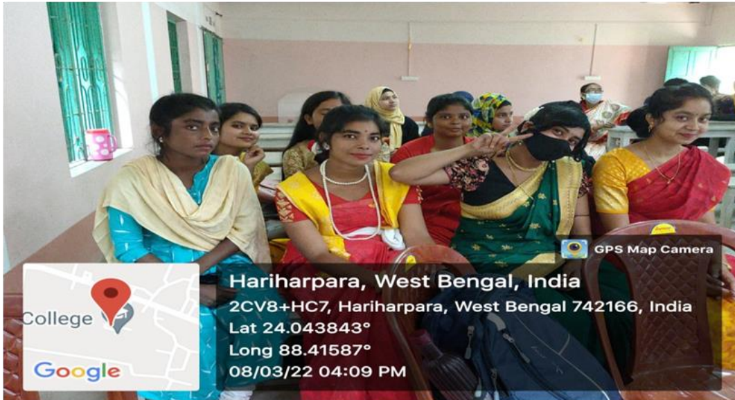
Students of the Department