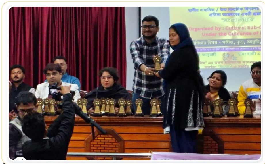
Encouraging achievement, confidence and participation