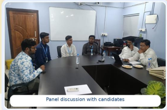
Panel discussion with candidates