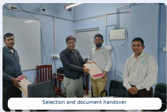
Selection and document handover