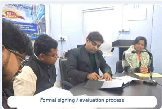
Formal signing / evaluation process