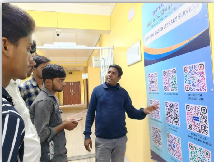
QR Code Based Library Services