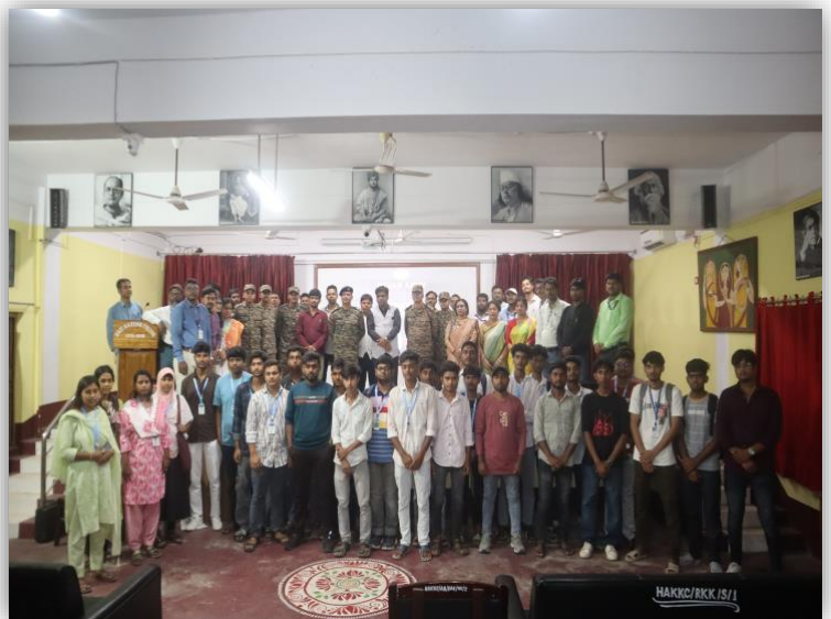
Celebration of the First Anniversary of Operation Sindoor