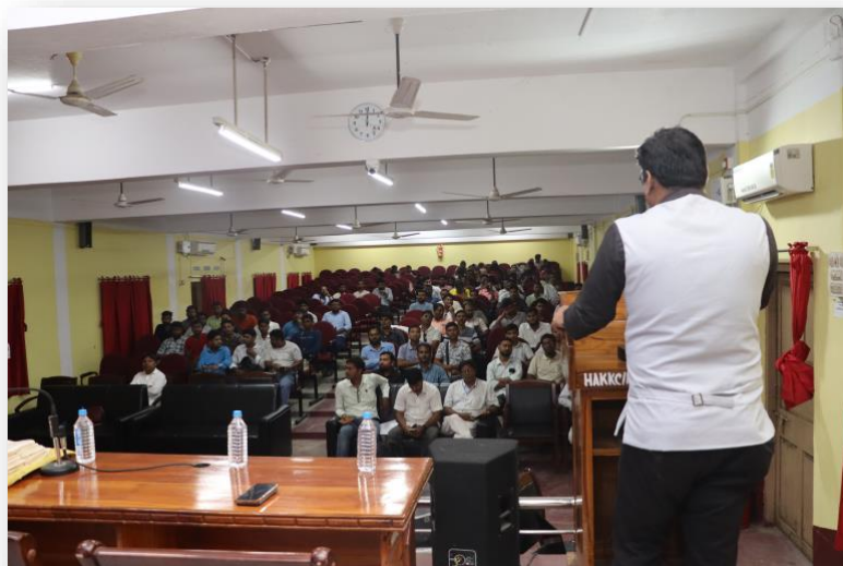
Student Interaction and Academic Orientation Session