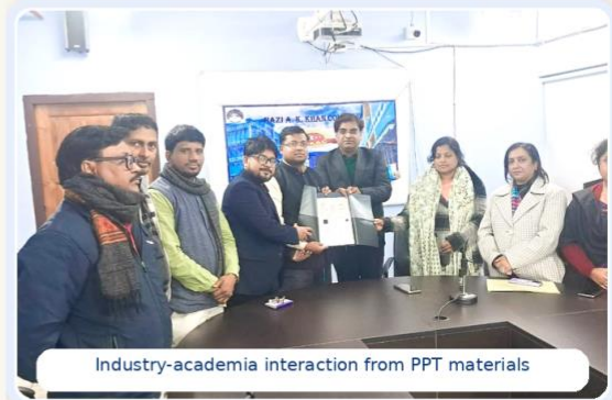
Industry-academia interaction from PPT materials