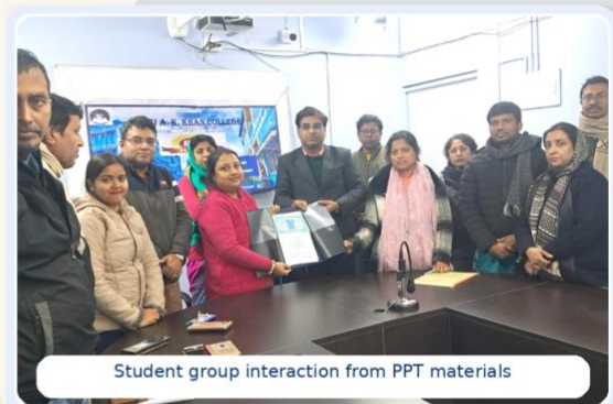
Student group interaction from PPT materials