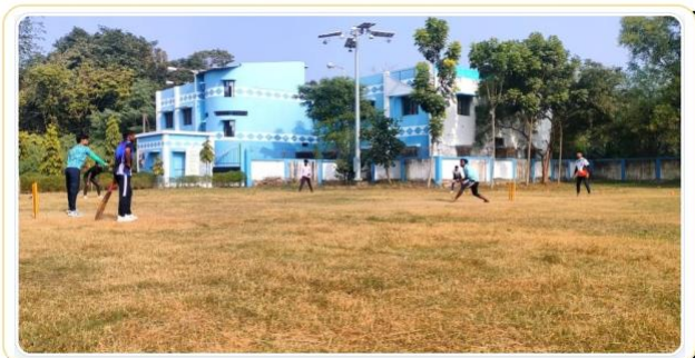
Sports and outdoor activities