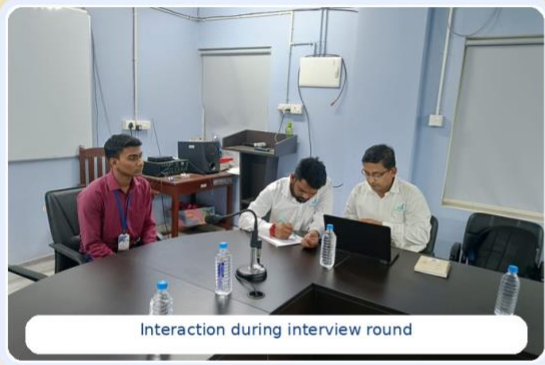
Interaction during interview round

Interview practice, professional interaction and student preparedness