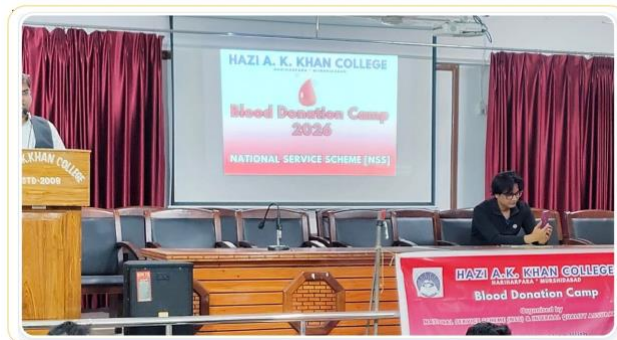
NSS and social responsibility